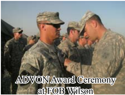
ADVON Award Ceremony at FOB Wilson