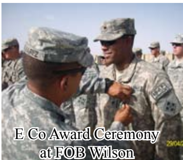
E Co Award Ceremony at FOB Wilson