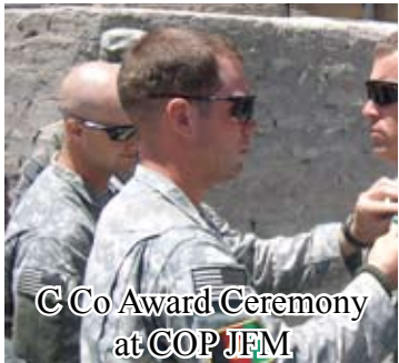
C Co Award Ceremony at COP JFM