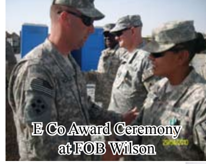
E Co Award Ceremony at FOB Wilson