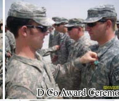
D Co Award Ceremony at FOB Wilson