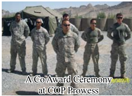
A Co Award Ceremony at COP Prowess