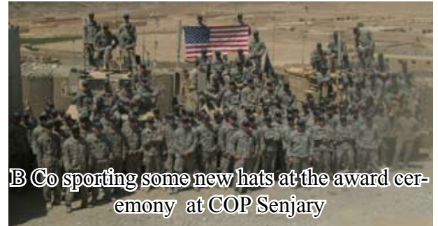
B Co sporting some new hats at the award ceremony at COP Senjary