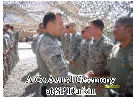
A Co Award Ceremony at SP Durkin