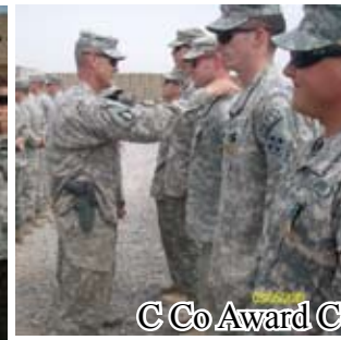
C Co Award Ceremony at FOB Wilson