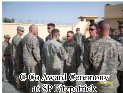
C Co Award Ceremony at SP Fitzpatrick