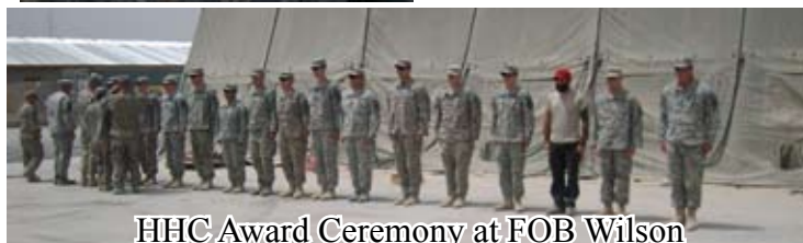
HHC Award Ceremony at FOB Wilson