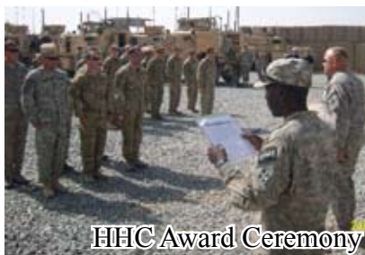
HHC Award Ceremony at COP Ashoque