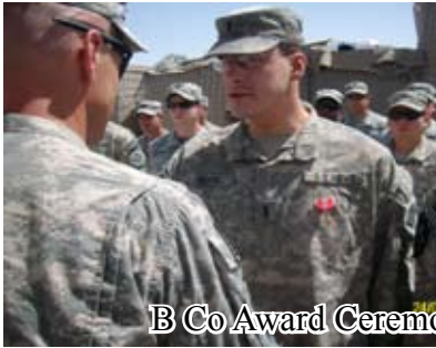
B Co Award Ceremony at COP Senjary