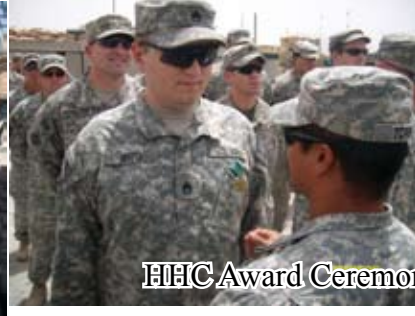
HHC Award Ceremony at FOB Wilson